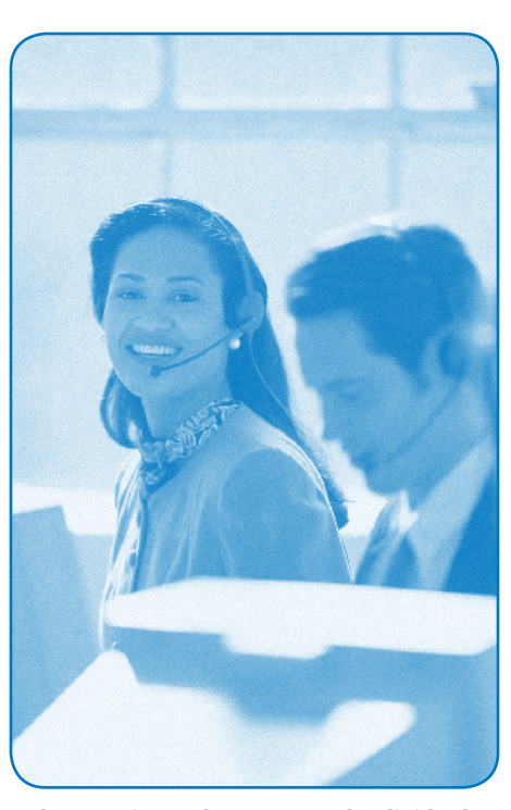
Pub 504 , Divorced or Separated Individuals — Form 8332.

Pub 505, Tax Withholding and Estimated Tax — Forms 1040-ES, 2210, 2210F, W-4, W-4P, W-4S, W-4V.