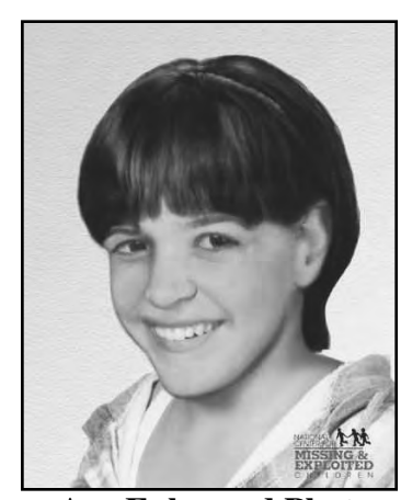
Age Enhanced Photo