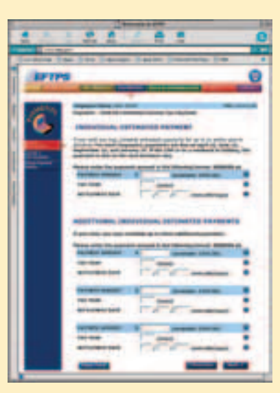
schedule a payment page

Don't worry about missing a payment because you're out of town or on vacation. And don't worry about remembering to make your payments on the right dates. EFTPS takes the worry out of paying your federal taxes on time.