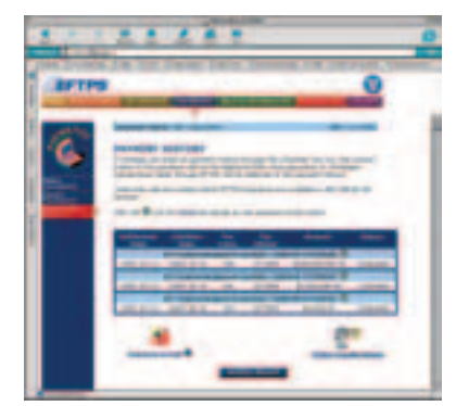
individual payment history page

With EFTPS-OnLine, you can logon and check all EFTPS payments you have made in the last 120 days*. Your payment history contains the type of payment, when it was made, how it was made, how much, when it was received, and when it settled. All this information is available to you online 24 hours a day, 7 days a week.